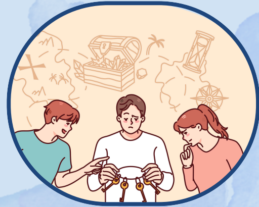
Public Health Quiz