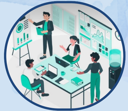
Scientific Poster Presentation